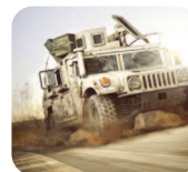
Military and Defense