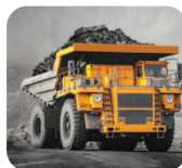
Mining and Metals