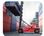
Port Authorities and Container Terminals