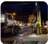
Utility and Public Works