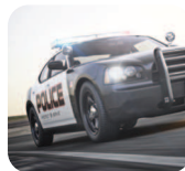
Police and Security