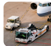
Airport and Airline